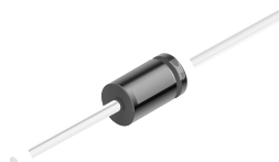
DO-35 Glass case