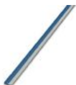
Continuous plug-in bridge, length: 500 mm, color: blue

Continuous plug-in bridge - FBST 500-PLC BU - 2966692