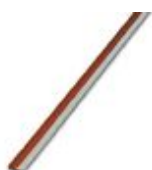
Continuous plug-in bridge, length: 500 mm, color: red

Continuous plug-in bridge - FBST 500-PLC RD - 2966786